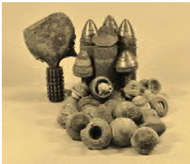
Fig. 6. Projectile fuses, detonated, various artifacts