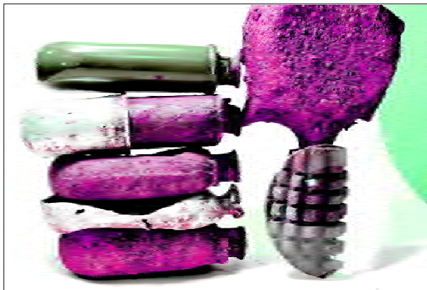
Fig. 3. Water canteens, magnifying glass