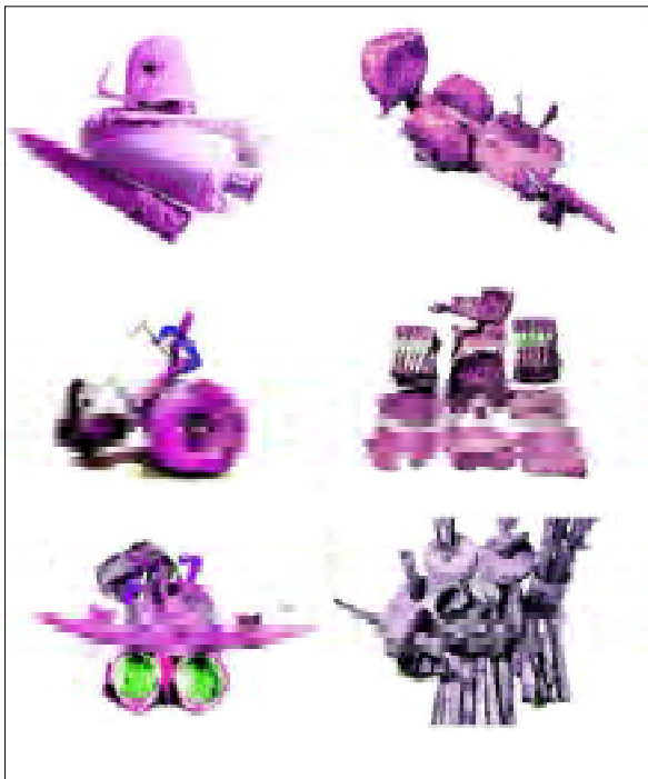
Fig. 1. Compositional structures