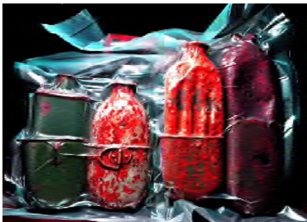
Fig. 5. Water canteens, experimental objects sealed in vacuum plastic bags