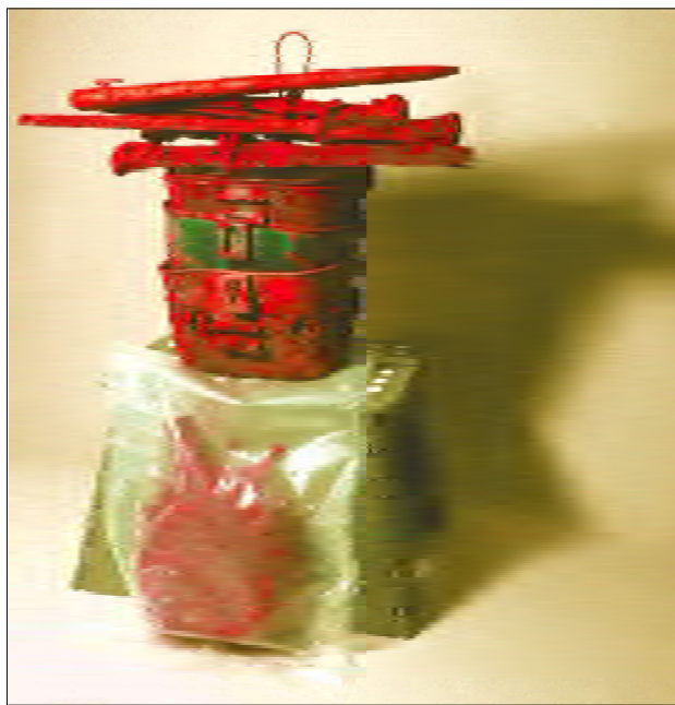
Fig. 4. Canteens, bayonets, readymade elements